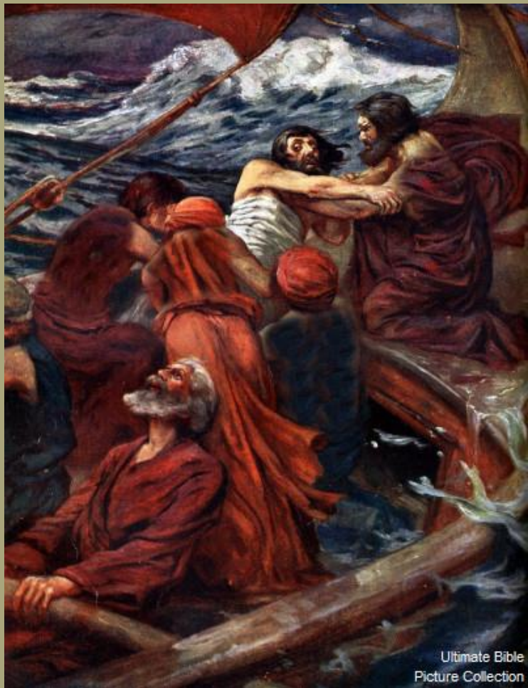
Ultimate Bible Picture Collection