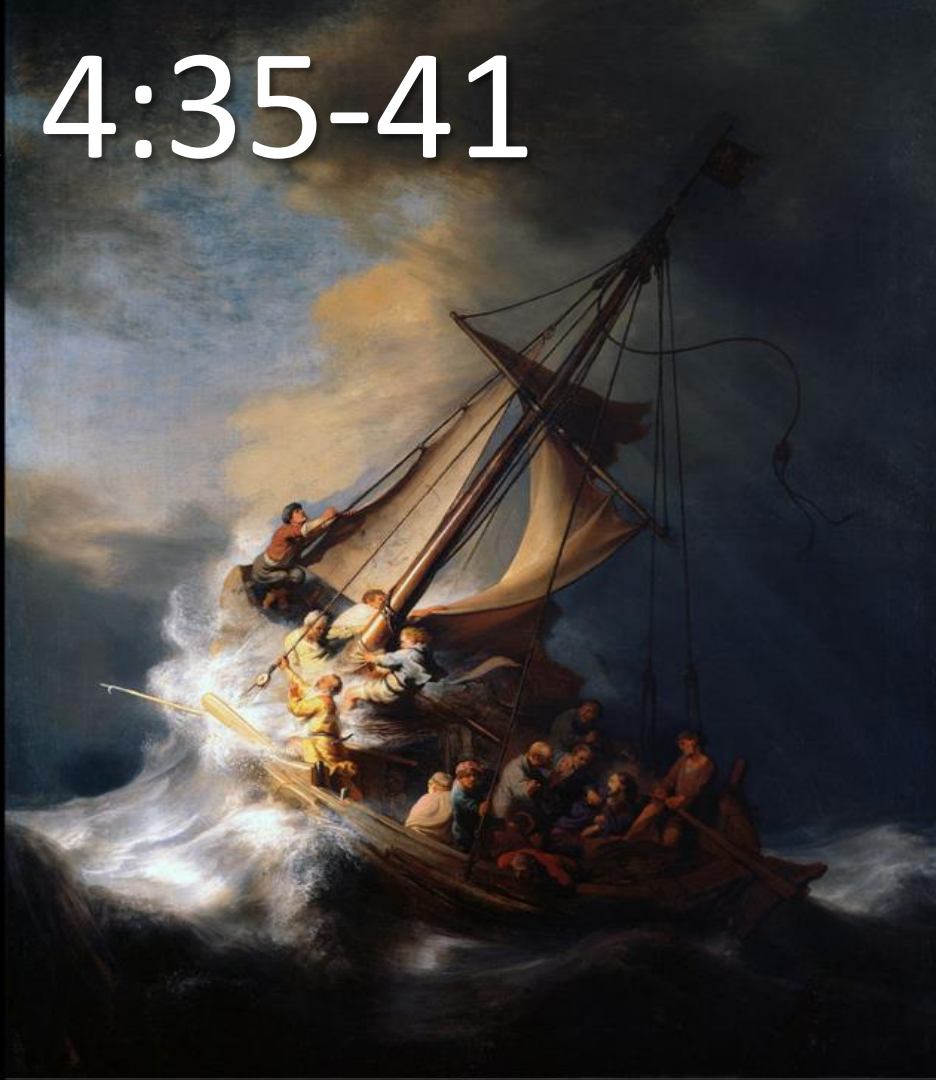
Rembrandt Christ in the Storm on the Lake of Galilee